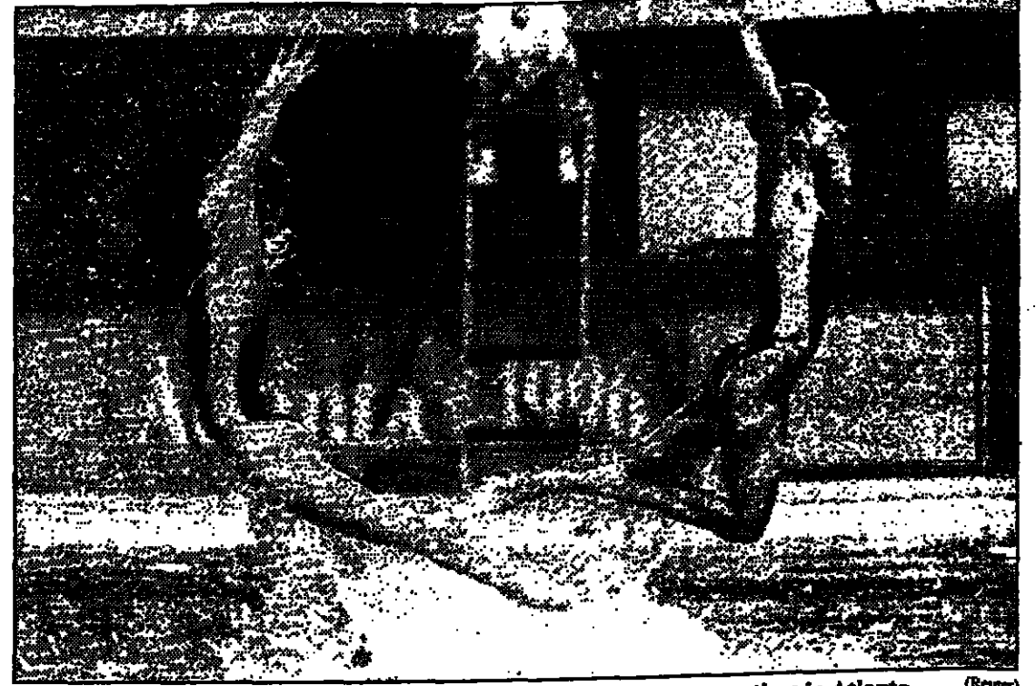
ALL TOGETHER NOW - Mexico's synchronized swimming team practices in Atlanta.

Vigo is situated in Galicia on the northwestern corner of the Iberian peninsula.